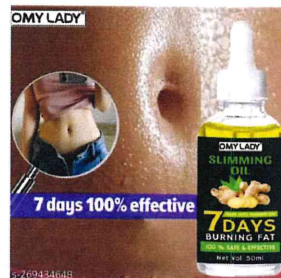
OMY LADY Su...